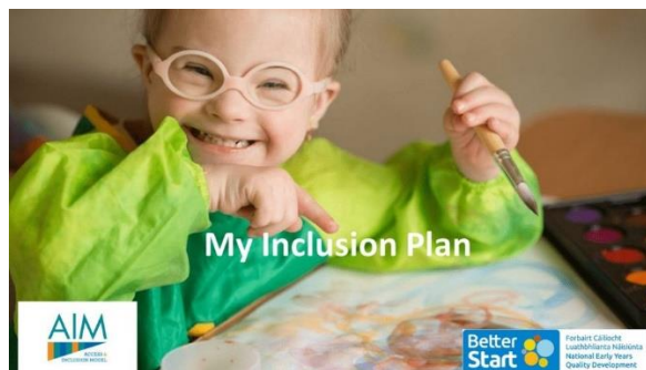
My inclusion plan

Booking: https://www.eventbrite.ie/e/access-and-inclusion-model-information-sessions-for-parents-tickets-42326928837